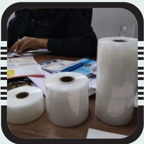
Polyethylene Stretch Film