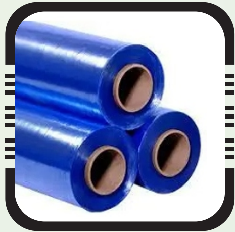
Blue Stretch Film