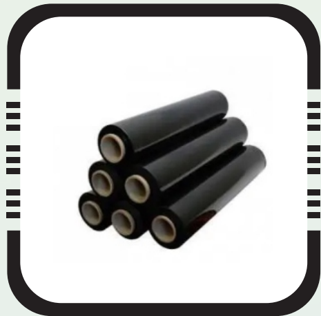
Black stretch film