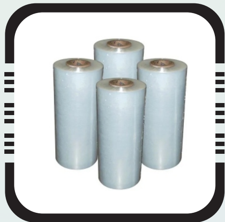
PE Lamination Film