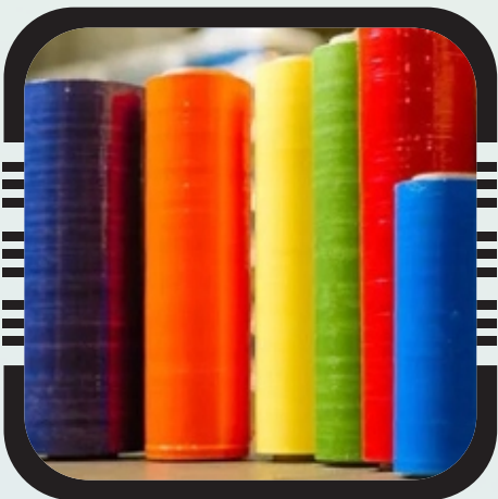
Colored Stretch Wrap