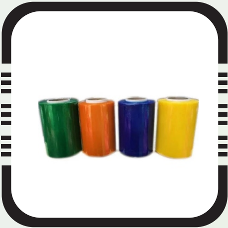
Colored Stretch Film