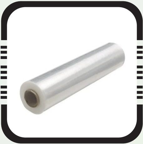
Transparent Stretch Film