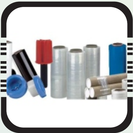
Packaging Wrap Film