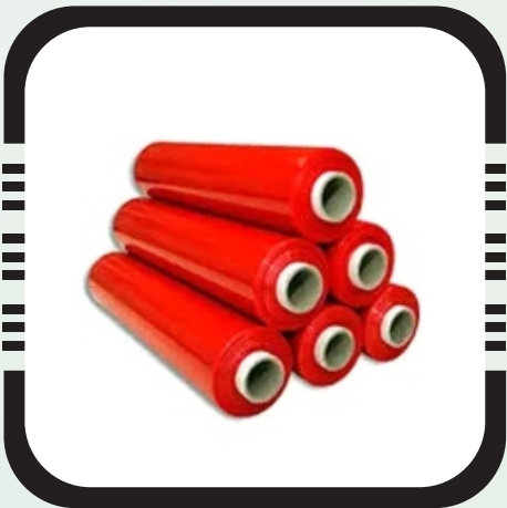
PE Stretch Film