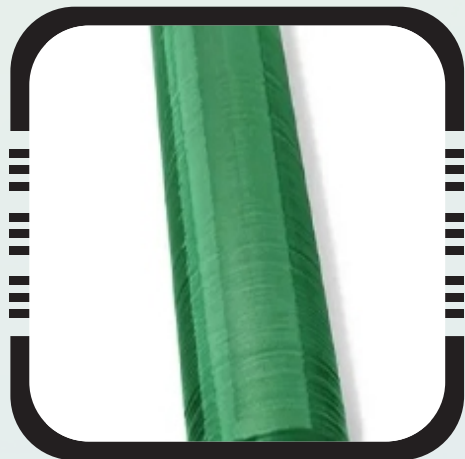
Green Stretch Film